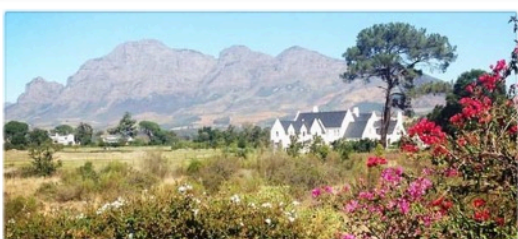
Owens Family Newsletter