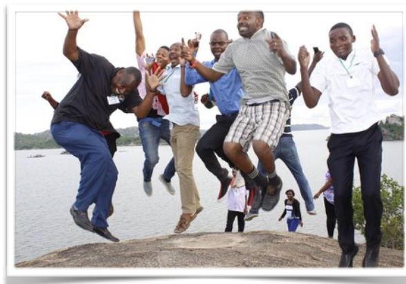
Vineyard pastors .... letting their hair down... :D

We were totally blessed by meeting radical Christians who are spending themselves for the poor and giving away their gifts and love on the world around them. How refreshing!