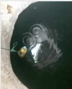
Our tank with 300,000 litres of water and our "sophisticated" measuring tool.