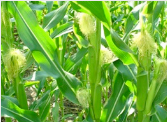
Beautiful maize plants.

We recently faced a very serious famine in many parts of Tanzania when crops that were planted did not receive enough rain and died on the stalk. We sent out a plea for prayer to our networks with our home church (Emmanuel Christian Community) calling members to prayer. Within a day, the rain started and has continued to do so without the usual devastating flooding. We are so thankful. We've rarely seen crops so lush and healthy in our area. Farmers are overjoyed.. our tank is FULL. We are extremely thankful. Thank you for your prayers and support!