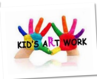
Kids Art Class