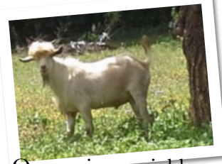
Our curious neighbour