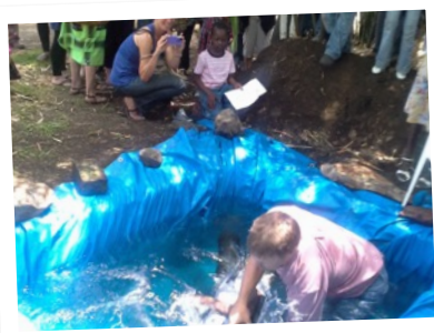
Another baptism at Arusha Vineyard

Vineyard Growth: Baptisms. Arusha Vineyard has been baptizing folk on a regular basis. We have dug a hole in the back yard, filled it with a tarpaulin and then take a hose and fill it with water. We now need to build a proper baptismal pool that we can cover to keep out the kids and the snakes. Not enough chairs!!! For weeks now, Sunday school teachers have been plotting how they can accommodate the growth in their classes. Rugs under trees, bench seats instead of chairs, each child donating $10 for a chair.... these are all various strategies being discussed because we face the wonderful problem of growth. The property team meet tomorrow to find some more permanent solutions.