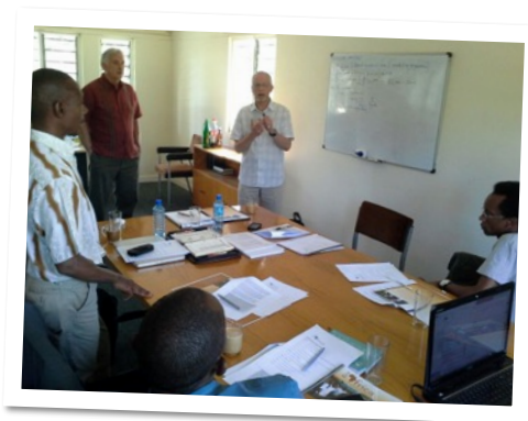
Vineyard School Ministry