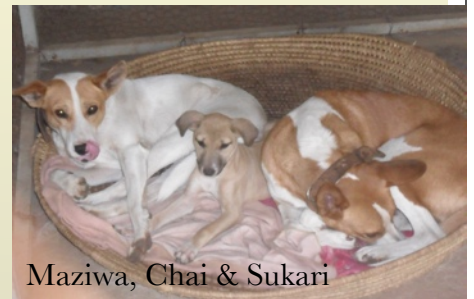
Maziwa, Chai & Sukari

dogs Sukari and Maziwa (Sugar and Milk). Of course the new puppy is called Chai (tea). This brings the total to 7 hens, 7 ducks, 3 dogs, 3 guinea fowl, numerous geckos, "and a partridge in a pear tree!"