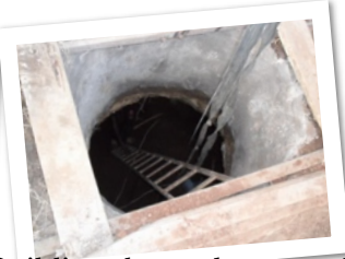
Building the underground water tank