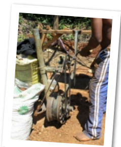
Digging the Water tank