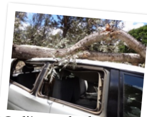
Judi's crushed car