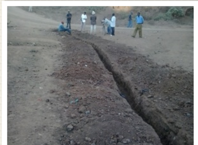
WATER SUPPLY ARRIVING!