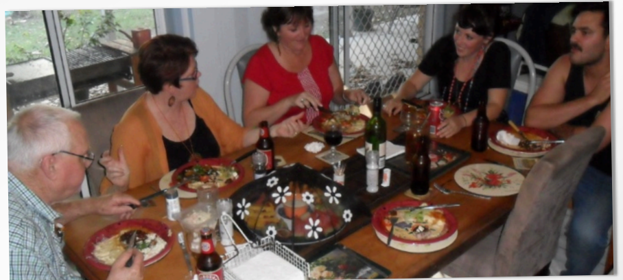
CHRISTMAS LUNCH TABLE 1 OF 3