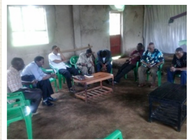
PASTOR'S GROUP MEET